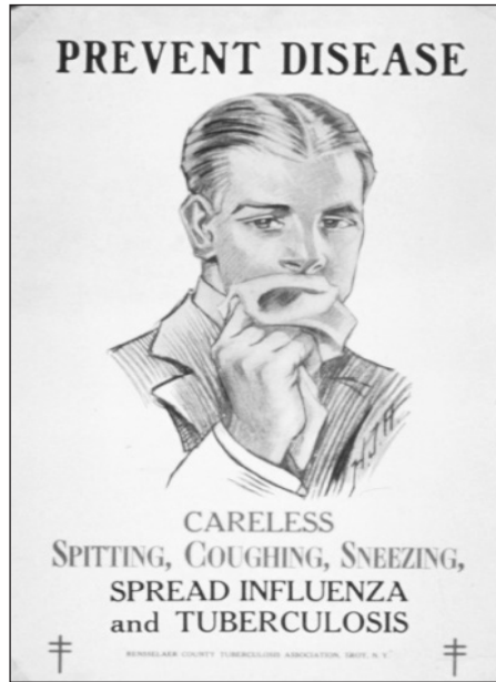
[Attempting to prevent disease in the mid-20 th century]

Use Sources A, B and C to identify one similarity and one difference in attempts to prevent illness and disease over time. [4]