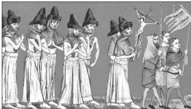
[People attempting to prevent disease in the 14 th century]