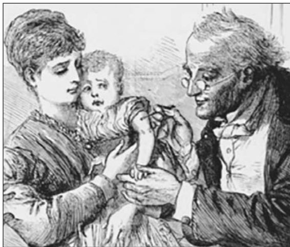
[Attempting to prevent disease in the 19 th century]